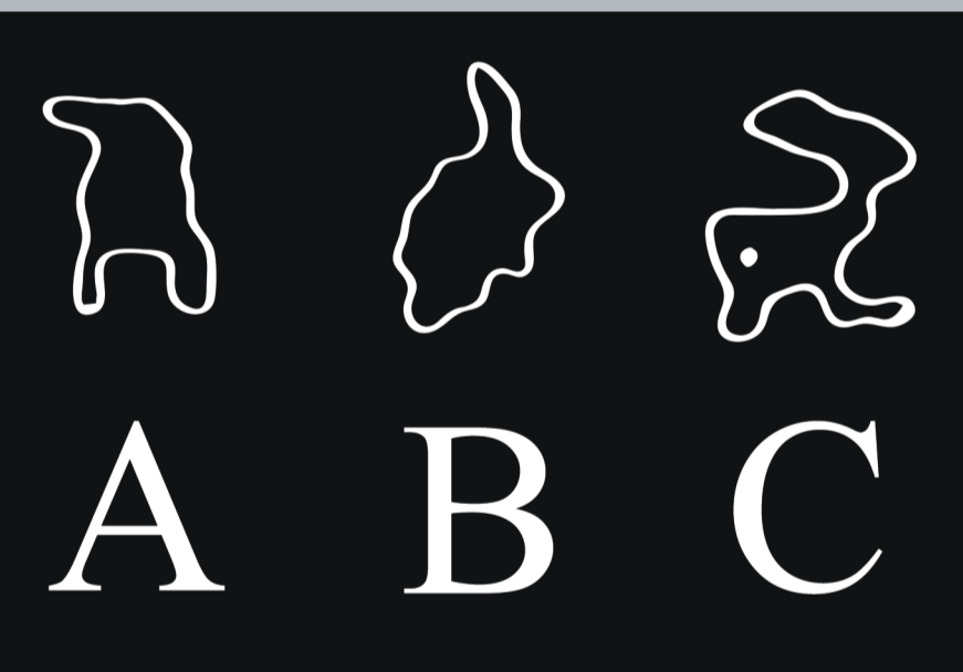
Birthe Blauth Alphabet_2018

For the exhibition, all artists have selected works that could not have been created without the influences of their fellowships in New York. The exhibition X=change not only invites visitors to discover the developments of individual artists, but also to discuss the significance of cultural exchange on the basis of these examples.