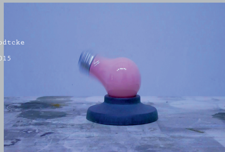
Anne Wodtcke bulb_2015