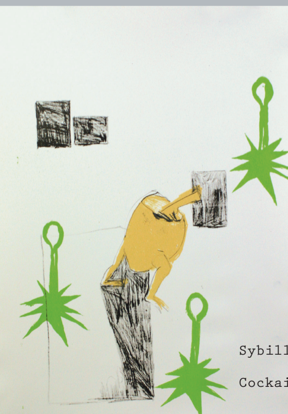
Sybille Rath Cockaigne_2017