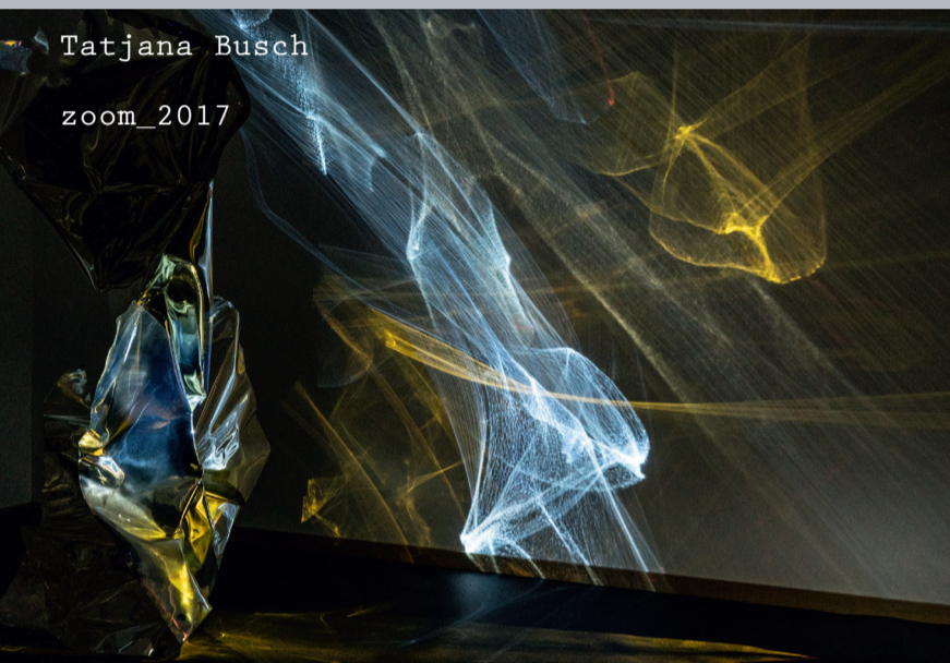
Tatjana Busch zoom_2017

For the exhibition, all artists have selected works that could not have been created without the influences of their fellowships in New York. The exhibition X=change not only invites visitors to discover the developments of individual artists, but also to discuss the significance of cultural exchange on the basis of these examples.