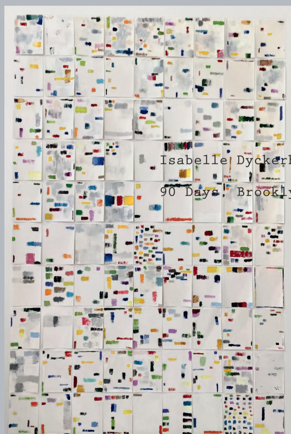
Isabelle Dyckerhoff 90 Days, Brooklyn Diary_2015